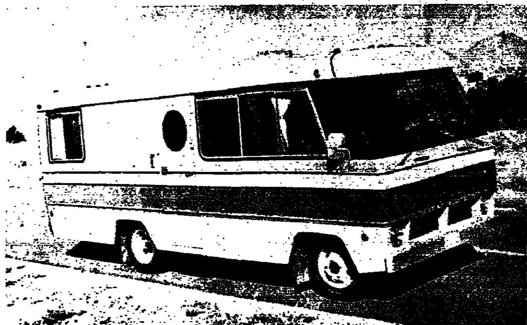
Nuclear shipment escort complete with armour plate and bullet proof glass.

But these issues will be the litmus test of how thorough an overhaul of U.S. foreign policy Carter envisions.